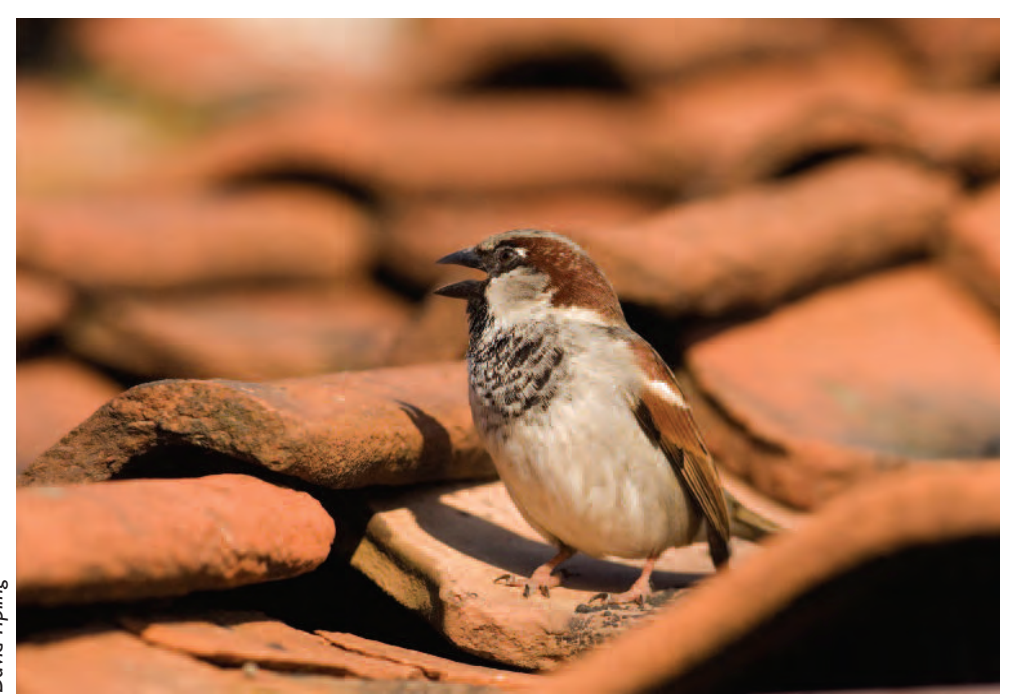
130. The presence of a chirping male at a potential nest-site is one of the key indicators of an active House Sparrow Passer domesticus nest.

Although House Sparrows occur in farmland, the prime habitat is the built-up environment. House Sparrows are social birds that, even in a uniform environment, live and breed in loose, discrete colonies, typically consisting of 10-20 pairs, and they are extremely sedentary (Summers-Smith 1963; Summers-Smith & Thomas 2002). During the breeding season, adults provisioning young forage mainly within a 70-m radius of the nest (Mitschke et al. 2000). Outside the breeding season, Vangestel et al. (2010) found that in urban populations the core range (the OES, or outlier-exclusive core area, which quantifies the amount of habitat effectively used by individuals) of a number of radiotracked House Sparrows increased as patches of shrubbery, hedges, and other key elements of cover became less scattered, i.e. range was greater in suburban than urban areas. Urban House Sparrows occupied significantly smaller home ranges than conspecifics from rural areas.